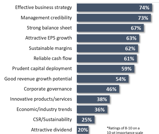
Very Important* Attributes That Drive Investment Decisions (Total Global Buy-side, April 2017, n=336)

*Ratings of 8-10 on a 10-pt importance scale